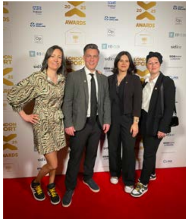
Proud runners up at the London Sport Community Impact Awards 2025

More details on all our services can be found on the following pages.